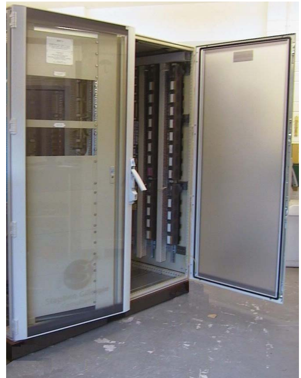
Front of Panel

The metering regime for Buzzard compliments the complex and sophisticated process facilities and encompasses a total of 65 meter streams. Utilising conventional flowcomputers for such a system did not appeal to the platform designers, particularly with respect to the number of panels bays required to house such a system. This, along with the desire to employ 'state of art' technology, lead to the selection of the SGC MeterNet solution.